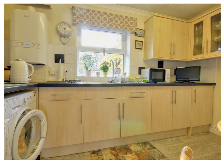
2 Tudor Court, Willerby HU10 6BF £120,000